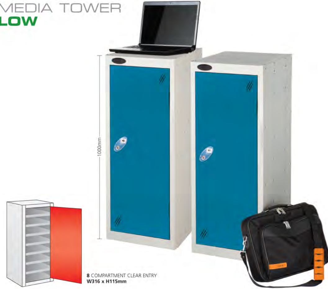
8 COMPARTMENT CLEAR ENTRY W316 x H115mm