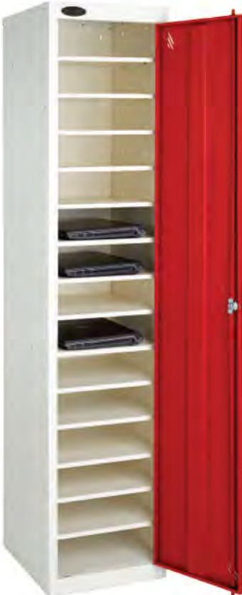
15 COMPARTMENT CLEAR ENTRY W316 x H115mm